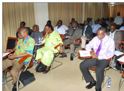
Cross section of participants follow the proceedings intently