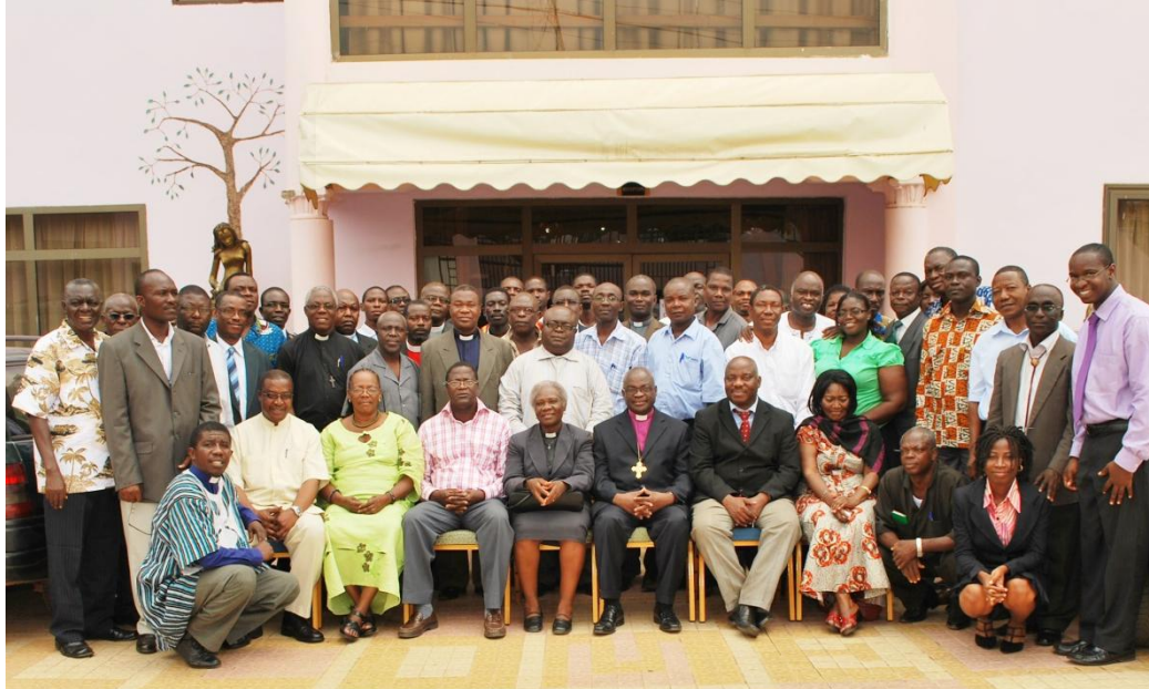
Participants of PROCMURA's Interfaith Revival Workshop