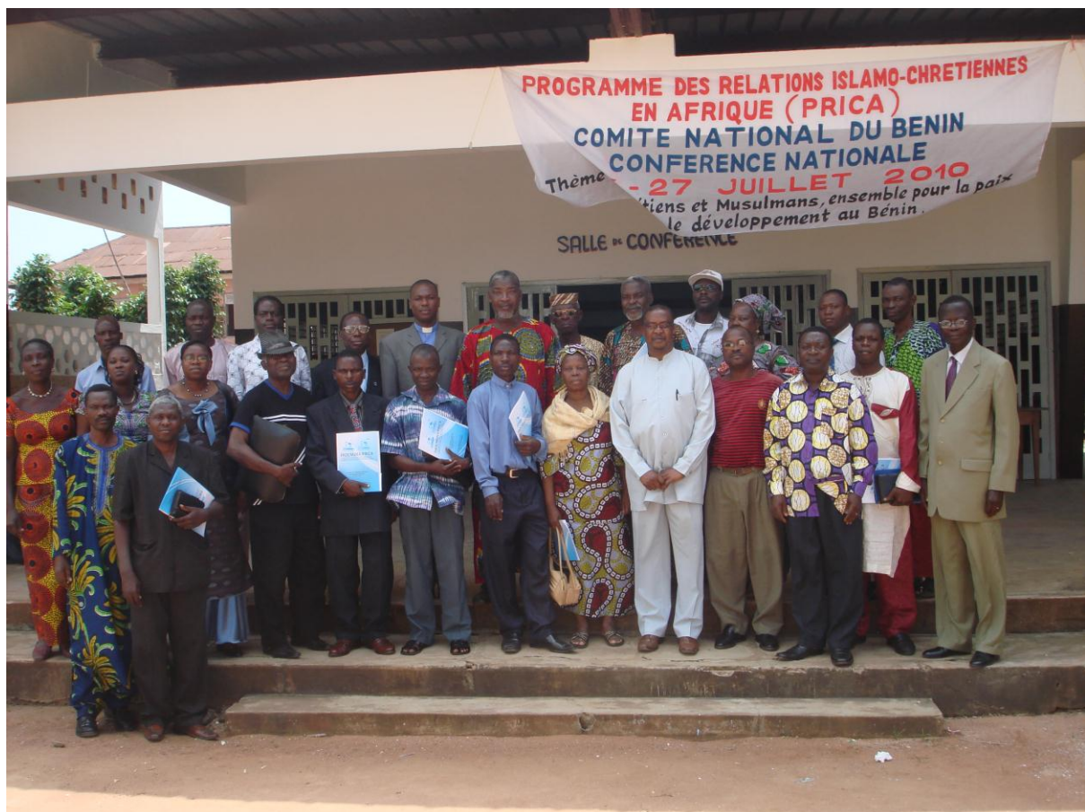
Adopted: The Conference