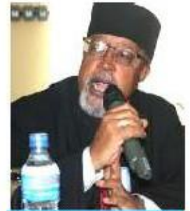
Archbishop Abune Berhaneyesus D. Souraphiel ETHIOPIA

well as high places (eg. the continent's religious organisations, civil societies, regional government authorities, central government administrations, parliaments, and the African Union). Considering the great job that PROCMURA does and its wealth